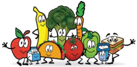
MENU SUBJECT TO CHANGE WITHOUT NOTICE