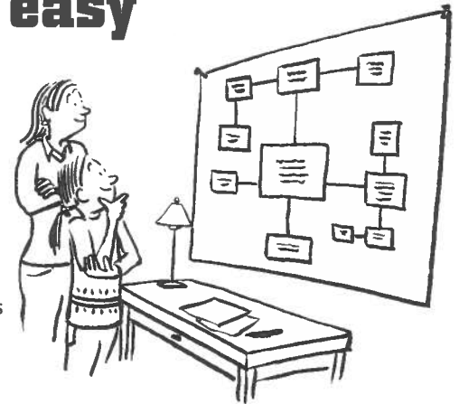
diagram into paragraphs. The opening paragraph should contain her main idea, and the first sentence of each subsequent paragraph should come from one of the subtopics in her plan. Then, she can fill out each paragraph with facts from the small boxes.

Your child can write her paper logically by converting the ideas from her